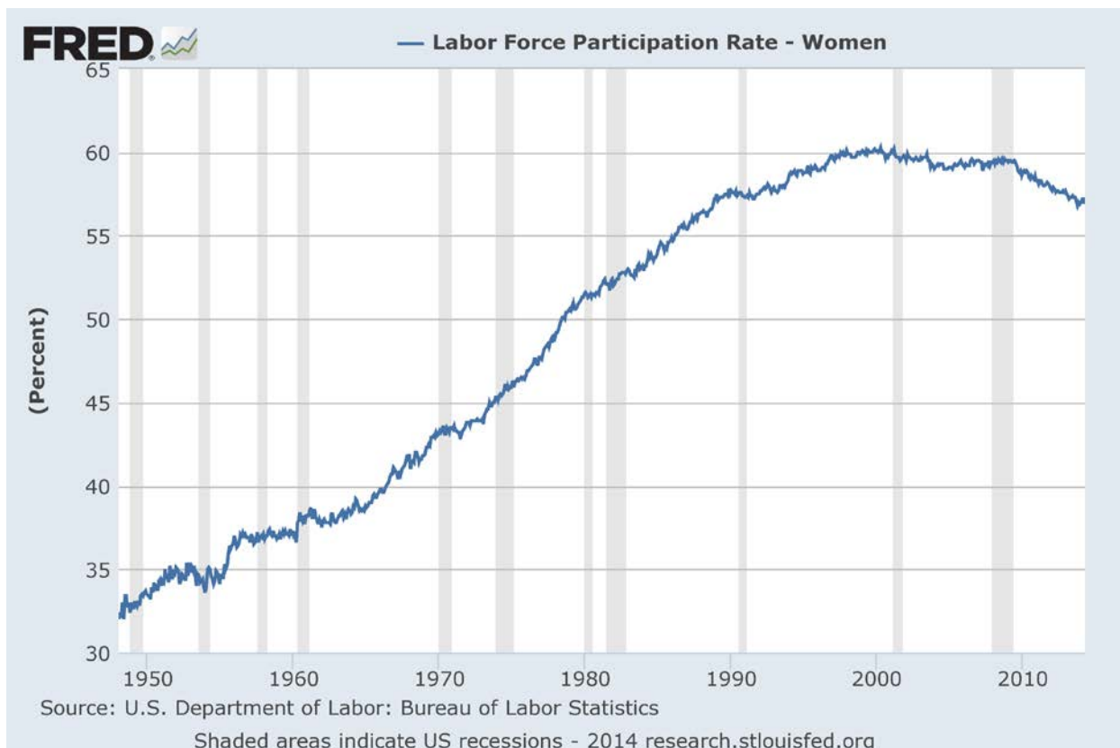
Chart 3 30