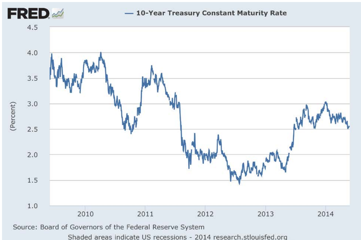
Chart 1 6

Interest rates can stay low for a long time, as we have seen in Japan, where they have been below 1 percent for over 20 years. Many now refer to a long-term low interest rate scenario as a “Japan” scenario.